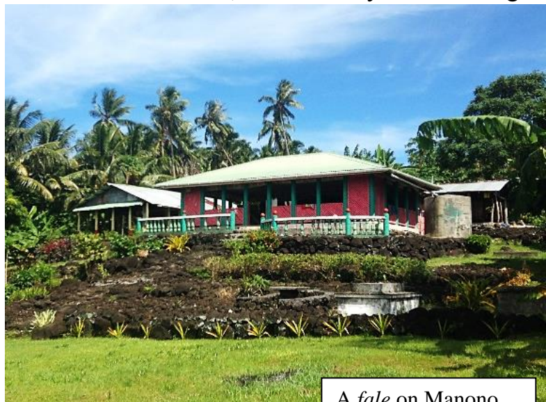
A fale on Manono

“Around,” we replied. And everyone was satisfied.