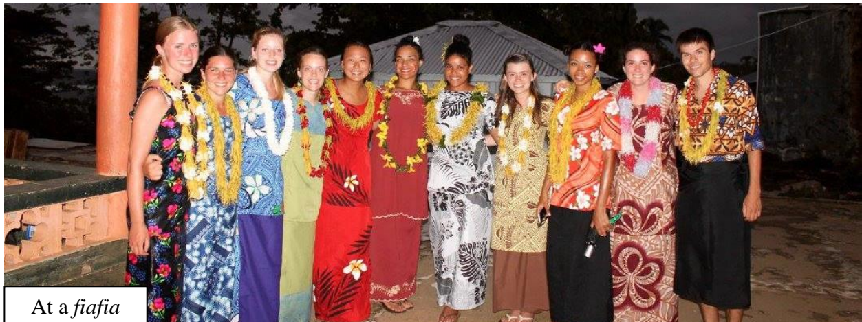
At a fiafia

Perhaps the most exciting part of the village stay is a traditional fiafia , or welcome ceremony. The fiafia is, in short, a potluck meets dance-off. Host mothers cook for their American children, then trade off songs and dances with the visitors, pulling up everyone at the end for a group dance.