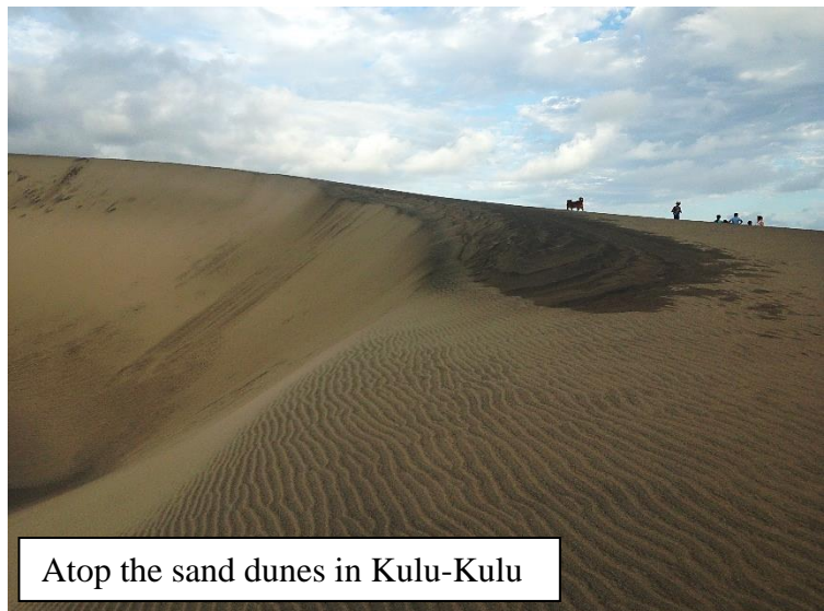
Atop the sand dunes in Kulu-Kulu

Yes, you are going to Fiji! This will not be the Fiji of resorts and honeymoons, though. Whether you're living with host families, practicing Hindi on the busy streets of Suva, or taking a trip to the highlands of Viti Levu, Fiji will show you how cultures can come together (or not) in the islands, in a country with a similar start but vastly different finish from Samoa.