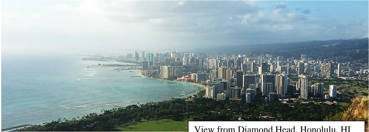
View from Diamond Head, Honolulu, HI

America’s last state, or its longest-held colony? It depends who you’re talking to. Orientation week in Hawai’i will get you acclimated to island life, as you bond with your group and gain deeper insight into an island society where modernization and tourism constantly clash with native ways and livelihoods, all while producing the Hawaiian image you know and love. The University of Hawaii’s East-West Center has catalyzed a great deal of research and advocacy throughout the Pacific, and is an ideal place to gain a deeper understanding of history, language, and current issues.